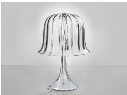
KALIKA, table lamp for VENINI

Rocca 1794 Piazza del Duomo 25, Milan 12 th - 17 th April 10.30am - 7.00pm