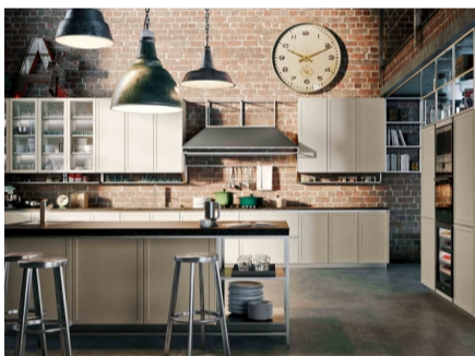
FRAME, HERITAGE, KELLY, kitchen collection for SNAIDERO

Salone Internazionale del Mobile 2016, EuroCucina Milan Fairgrounds