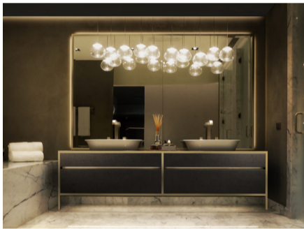
ALGONQUIN, bathroom collection for MILLDUE

Salone Internazionale del Mobile 2016, International Bathroom Exhibition Milan Fairgrounds