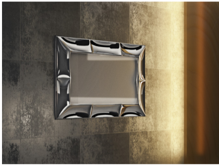
DORIAN, mirror for FIAM

11 th - 17 th April, 10am - 12 midnight 18 th - 23 rd April, 10am - 10pm